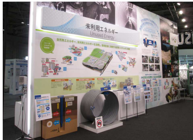
(Left) Ground Heat Utilization System