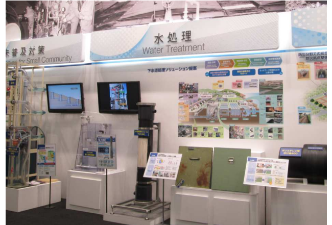
(Left) Water Treatment Membrane System, FILTUBE