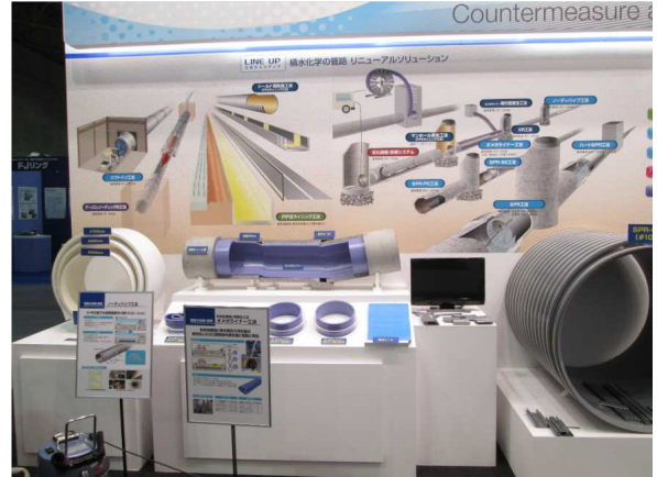
(Left) CIPP, (Middle) Fold & Form Method