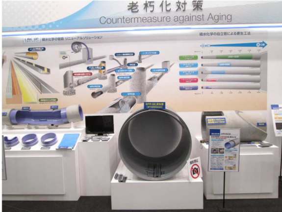
(Left) Fold & Form (Middle) Spiral Wound Method