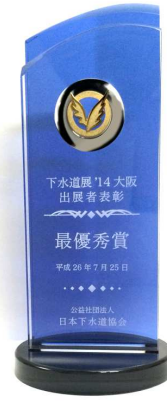
Certificate of Commendation and Commemorative Shield