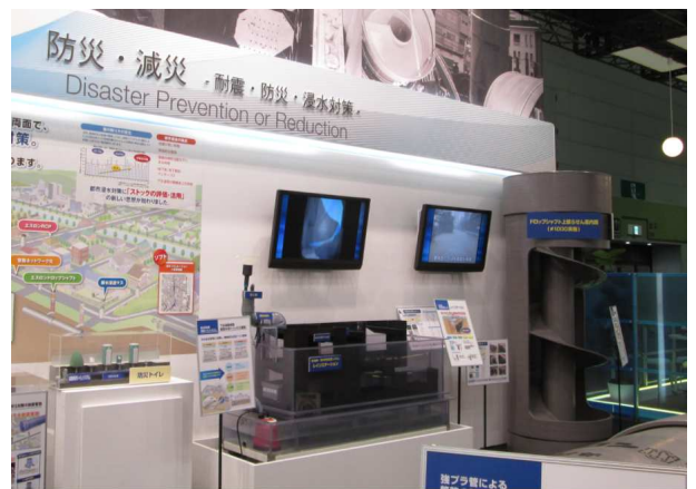
(Front) Temporary Toilet System (Middle) Rain Collection/Infiltration System (Back) Spiral Flow System, Drop Shaft