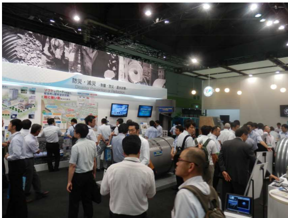
Visitors to our booth