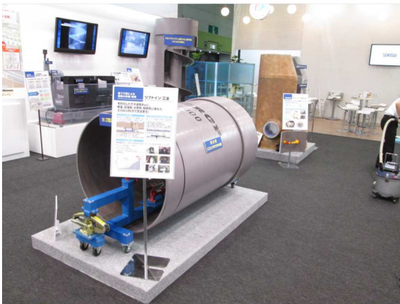
Pipe Jacking Method