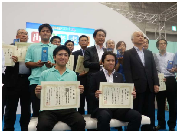
Award ceremony of "Exhibitors for Sewage Works Exhibition 2014"