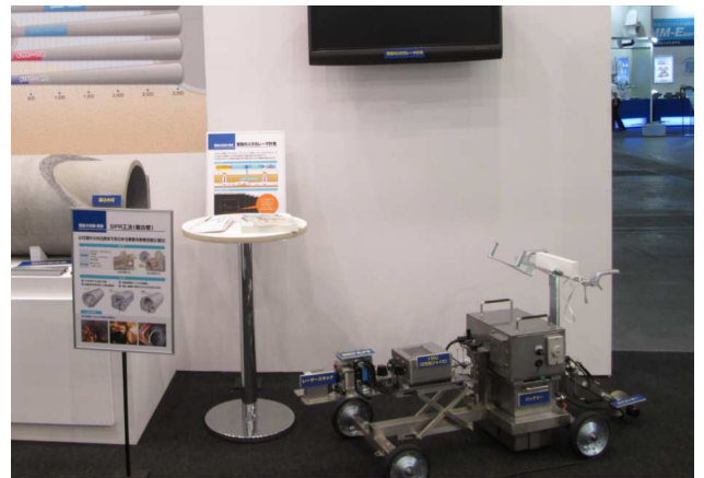
In-Pipe 3 Dimension Laser Measuring System