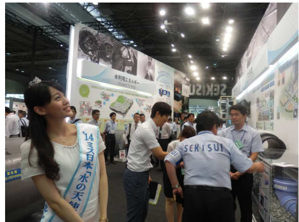
'14 Angel of water also visited our booth