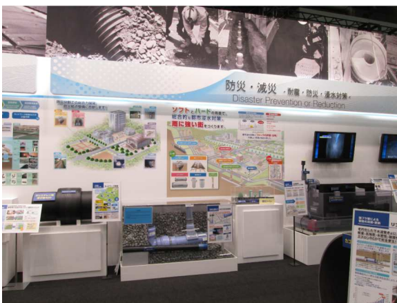
(Left) Large Diameter PE Pipe (Middle) Rib Pipe