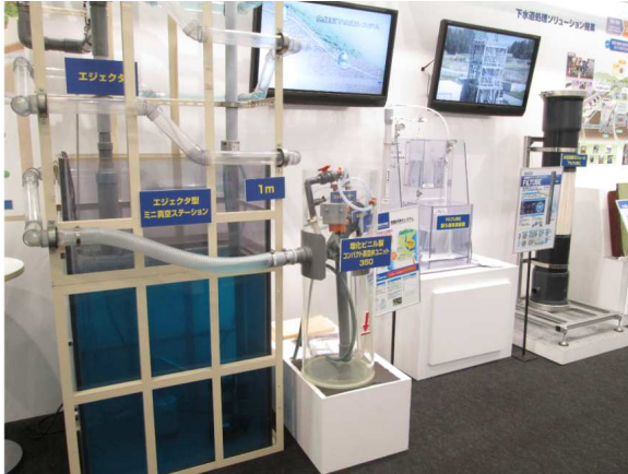
Sewer Vacuum Collection System, SIVAC