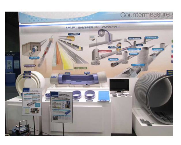
(Left) CIPP, (Middle) Fold & Form Method