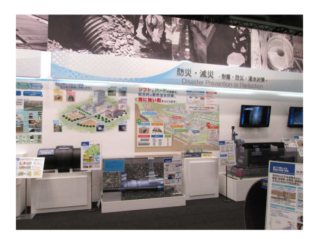
(Left) Large Diameter PE Pipe (Middle) Rib Pipe