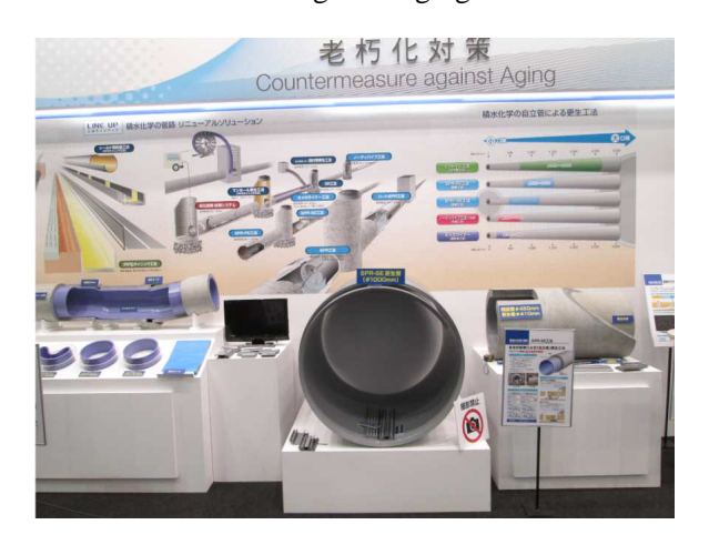
(Left) Fold & Form (Middle) Spiral Wound Method