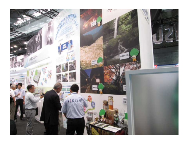
Exhibited the content of comprehensive project in Kawachinagano City as well as points of interest and regional goodies