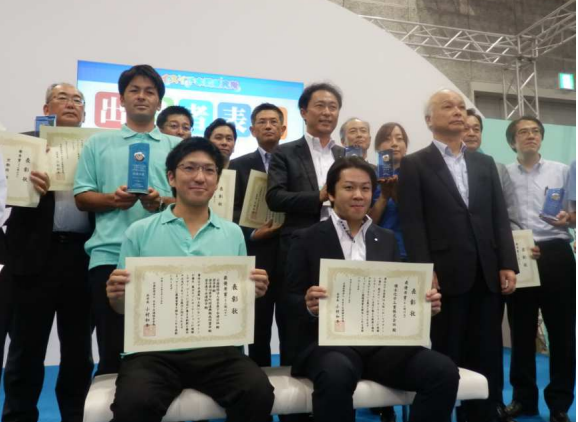
Award ceremony of "Exhibitors for Sewage Works Exhibition 2014"