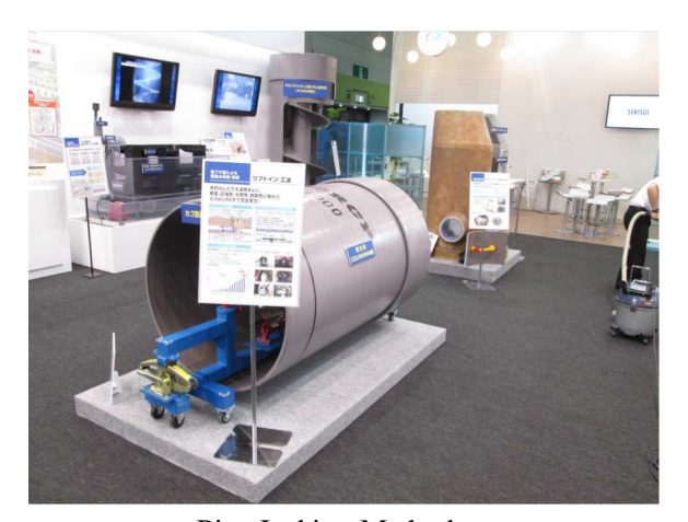
Pipe Jacking Method